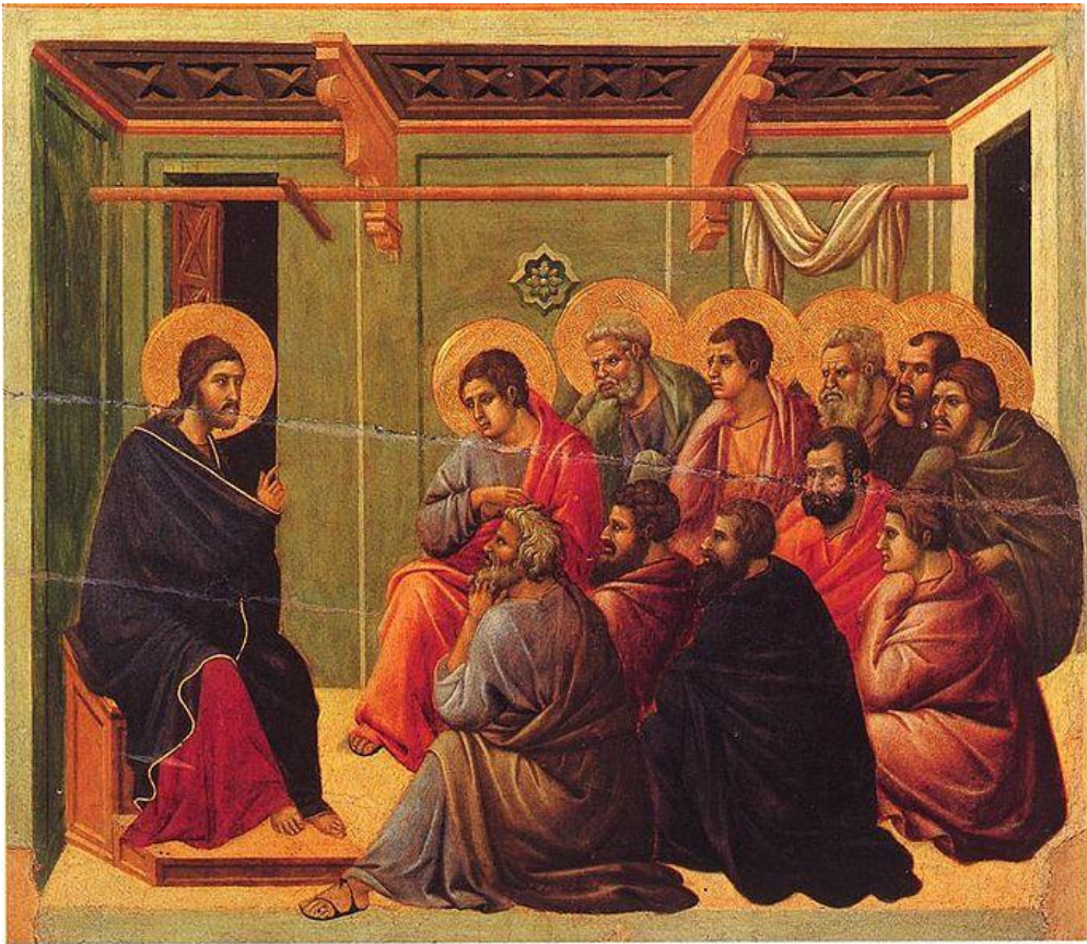
Duccio di Buoninsegna